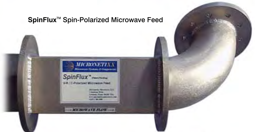
SpinFlux™ Spin-Polarized Microwave Feed