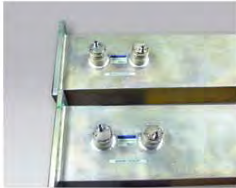
Precision Directional Couplers