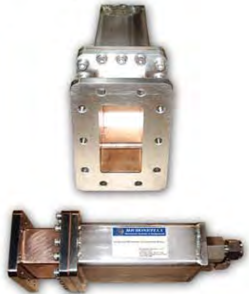
Liquid Resistor Waveguide Dummy Loads

Micronetixx Technologies, LLC ~ 70 Commercial Street ~ Lewiston, Maine 04240 USA