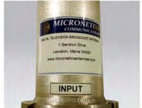
Welds that Surpass Industry Standards