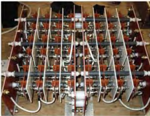
100 kW MW Source Rectifier Assembly