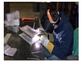
Custom Design and Manufacturing