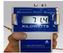
Portable Microwave Power Meters